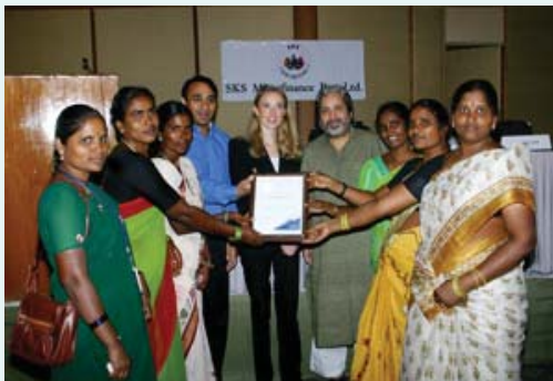
CGAP and SKS clients displaying Financial Transparency Award Honorable Mention plaque

Two of MicroVest's MFI clients, Mi-Bospo in Bosnia and Herzegovina and ACODEP in Nicaragua, were among the 20 winners. Additional Merit Recognition was awarded to clients Banco Solidario (Ecuador), D-MIRO (Ecuador), AMC de R.L. (El Salvador), Apoyo Integral (El Salvador), Crear Tacna (Peru), Edyficar (Peru), KLF (Kazakhstan), XacBank (Mongolia), and FORA (Russia). Congratulations to all.